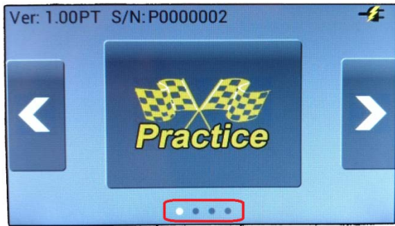
Figure 2 - Eliminator Next Gen Menu

Each multi-page menu in the Eliminator Next Gen is denoted by dots at the bottom of the screen. The number of dots indicates the