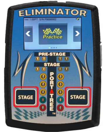
Figure 1 - Eliminator Next Gen STAGE Buttons

number of pages in the menu. The “white” dot indicates which page of the menu is currently displayed. To change pages, swipe your finger across the screen from left to right or right to left. See Figure 2.